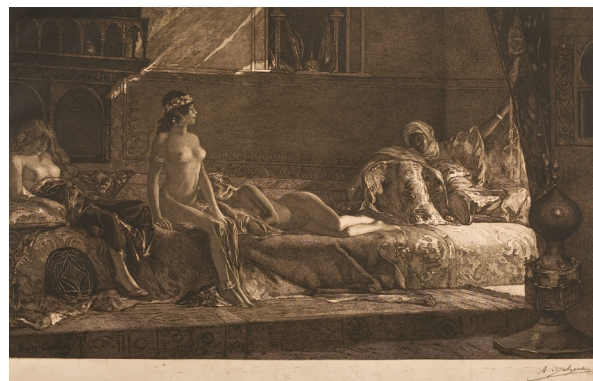
Antonin Delzers 1873–1943

Interpretare după Les Chérifas, de Jean-Joseph Benjamin Constant gravură stadiu 60 × 88 cm