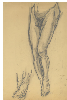
Camil Ressu 1880–1962

Schiță – nud creion pe hârtie 38,5 × 26,2 cm