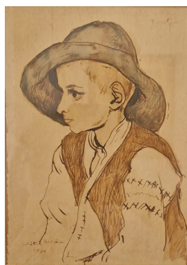
Nicolae Tonitza 1886–1940

Portret de băiat (Schitul Durău) tuș și laviu pe hârtie 20,5 × 15 cm