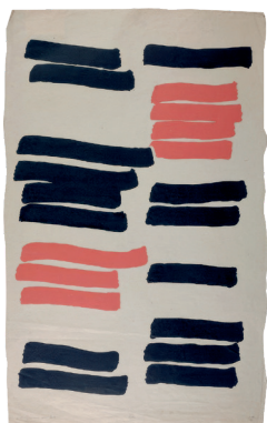
Ion Bitzan 1924–1997