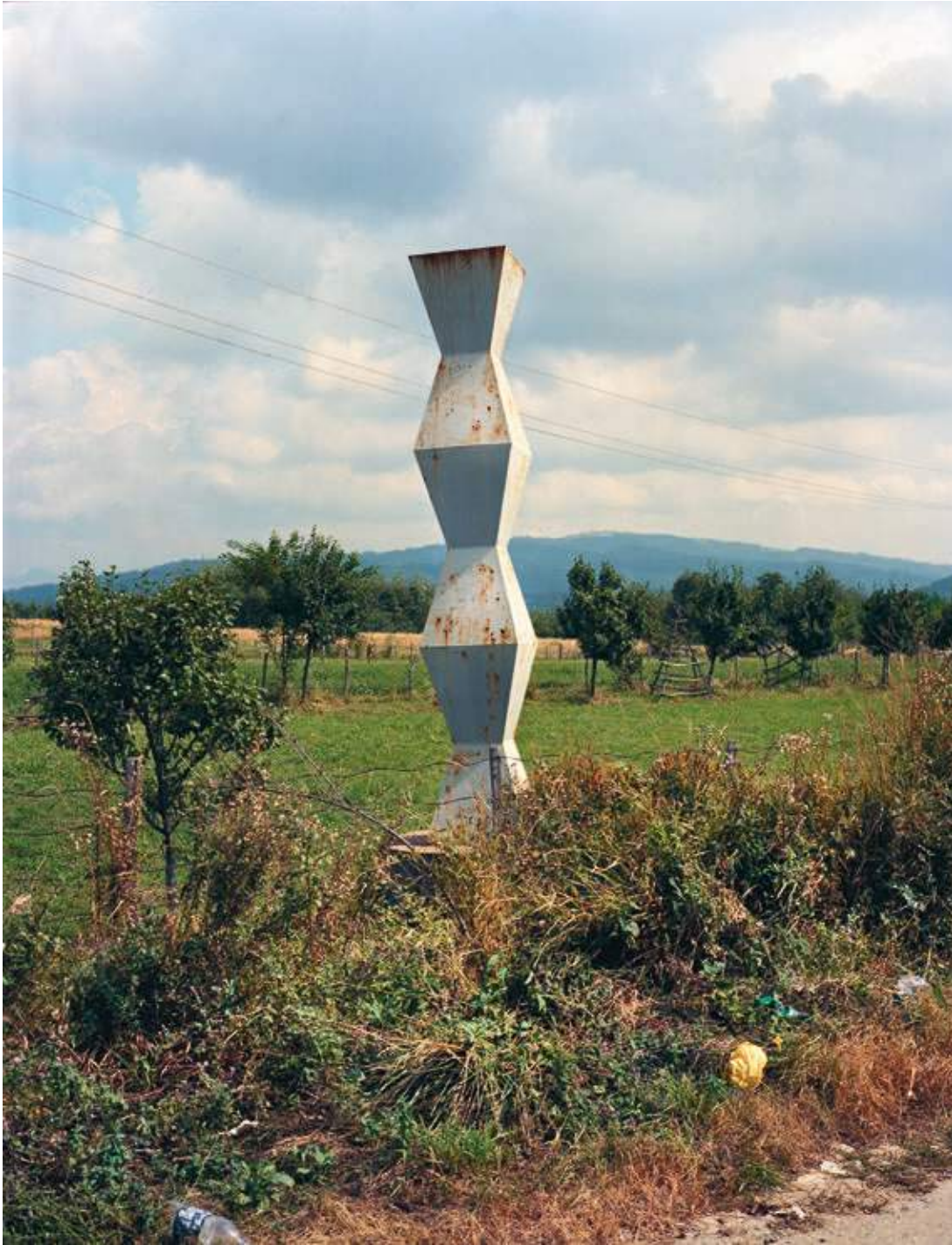
MB_2011_Dobrogea (SE Romania)