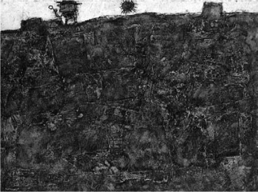
2.7. Jean Dubuffet. Le géologue , oil on canvas (1950).

would say that instead of painting the countryside as a place, he paints it as its underside: what presents itself there is the announcement of what is not there' (114). Although it is somewhat of a facile pun, this idea of endroit which is an envers suggestively describes the rough stretches of land that are so devoid of any characteristics that they seem to depict not only the ground but also its other side, its underside. These places might be non-places, they might be the underground, the undergrowth or the soil seen from above, and throughout the 1950s, Dubuffet's painting seems to alternate between depicting plane and underground.