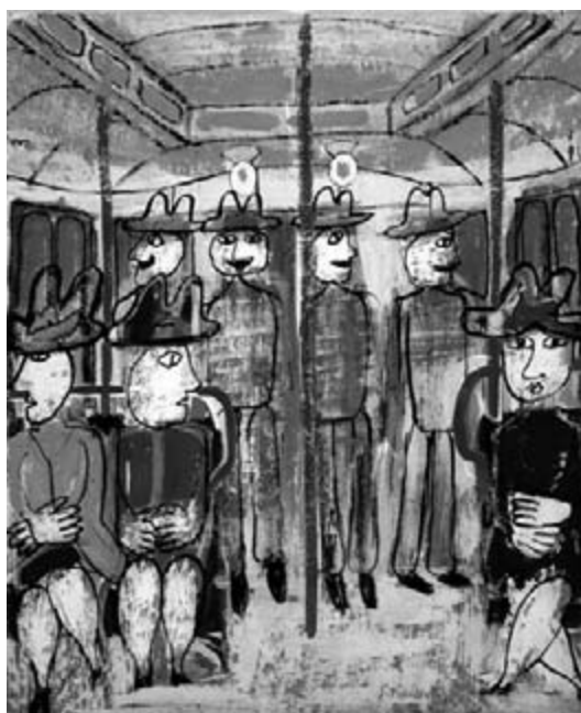
2.2. Jean Dubuffet. Métro , gouache on paper (1943).