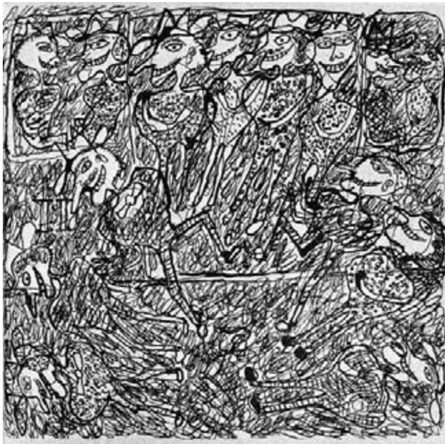
2.6. Jean Dubuffet. Plate 8 of Jean Paulhan's La Métromanie ou les dessous de la capitale . Lithograph on paper, transferred to stone (1949).

In a text from 1945, Dubuffet had evoked his difficulty in the 1920s and 1930s to find an entry point into painting: ' je cherchais l'entrée ', he wrote ('Plus modeste' 90). With the metro series Dubuffet finds an entrance into more experimental work, stocking up ideas experimented in linear drawing that will later be translated into painting. The metro lithographs are, furthermore, a cipher by which Dubuffet displaces his ' je cherchais l'entrée ' into an ' entrée en matière ' as