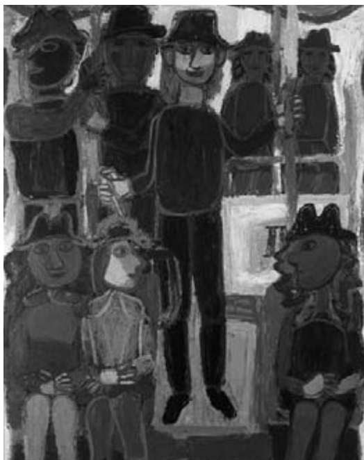
2.1. Jean Dubuffet. Métro , oil on canvas (1943).