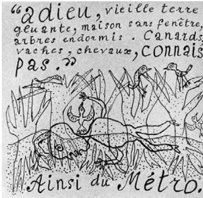
2.4. Jean Dubuffet. Adieu vieille terre... , on page 13 of Jean Paulhan's La Métromanie ou les dessous de la capitale . Lithograph on paper, transferred to stone (1949).