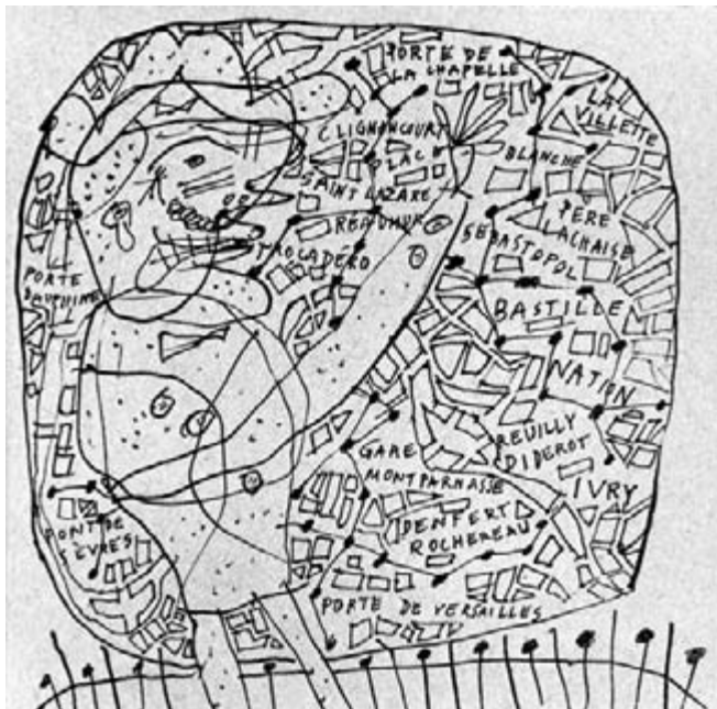
2.5. Jean Dubuffet. Plate 3 of Jean Paulhan's La Métromanie ou les dessous de la capitale . Lithograph on paper, transferred to stone (1949).