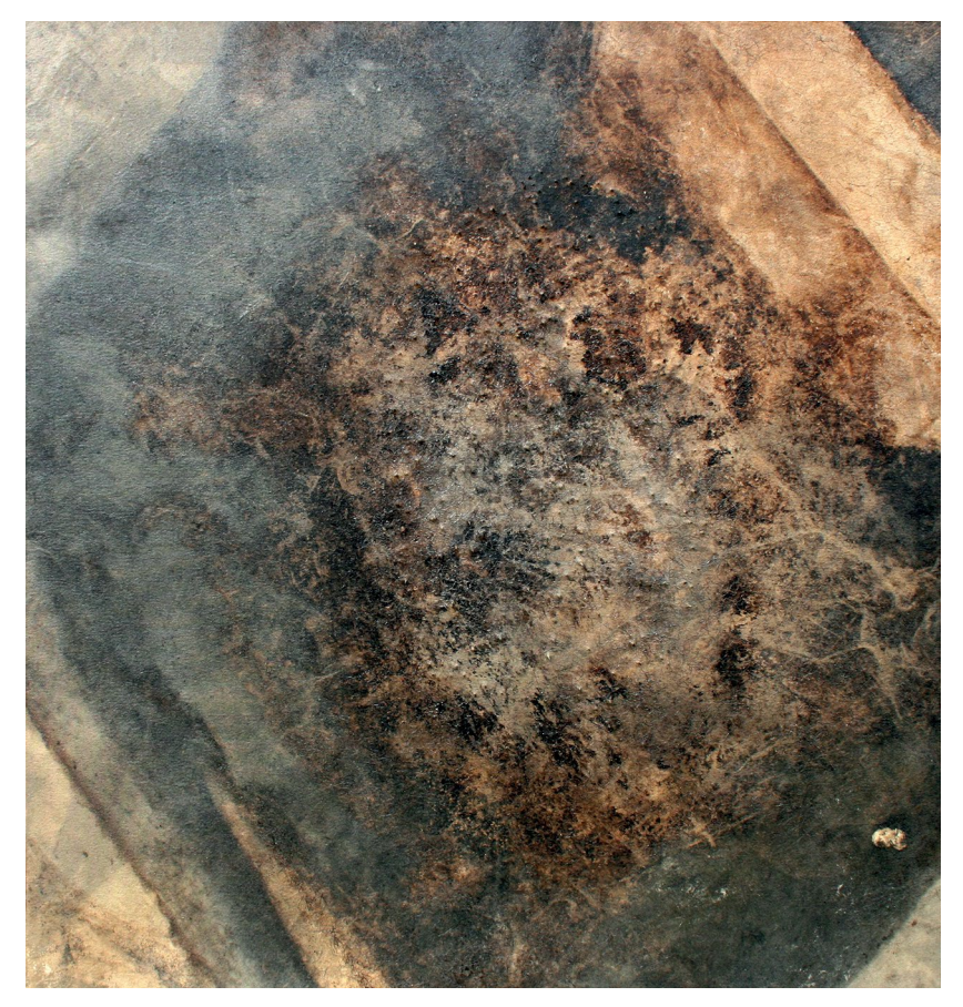
Figure 2.5: Sorcery painting (autumn echidna), Vanessa Barbay, 2011, echidna and rabbit-skin glue on canvas, 84 x 80 cm.

and meditate upon something of the human—animal relations that have led to the loss of life of the particular subject with which each work is concerned. Specificity is crucial: place and the materials of particular places loom large in the choices Vanessa makes in the production of each work.