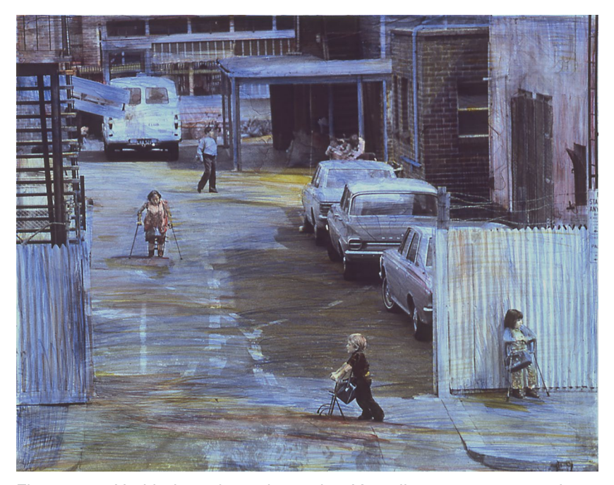
Figure 2.2: Untitled #2 , from the series Yooralla at twenty past three , Micky Allan, 1978, watercolour and coloured pencil on silver gelatin print, 27.7 x 35.2 cm.

by the dark room, and especially its chemicals, and was impatient for the photographs 'to be there', ready for her to paint. Photographs were ultimately a form of technical support. Photographs were there in a time when 'painting seemed too hard'.